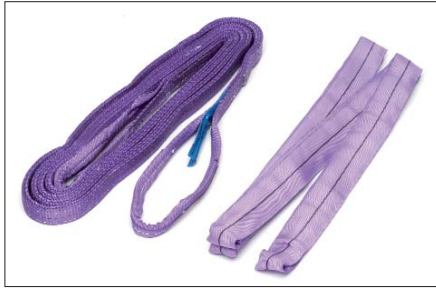
Lifting strap / Round sling