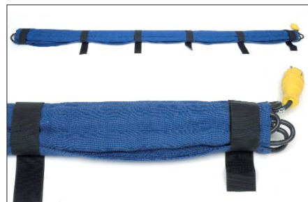
Cable heating blanket