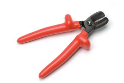
Small cable cutter