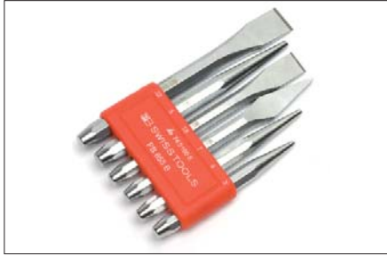
Chisel and punch set