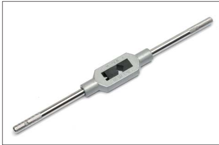
Adjustable tap wrench