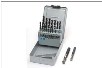
Drill bit set