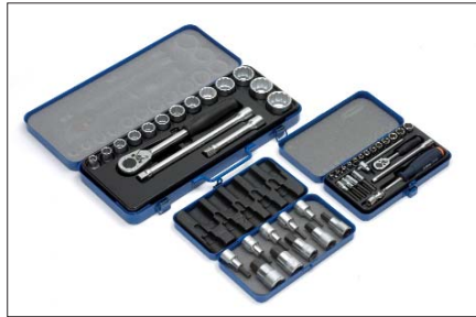
Allen wrench socket / Socket set