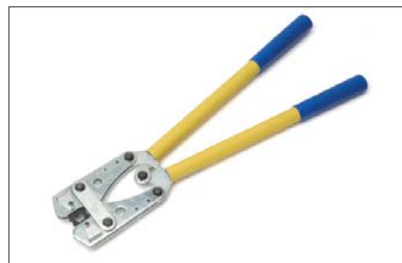
Mechanical compression tool