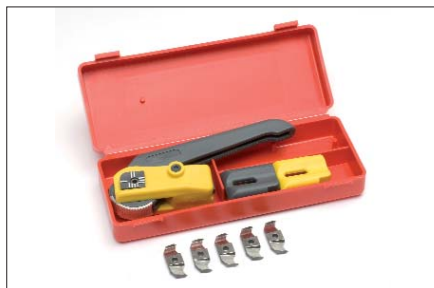
Cable sheath cutter