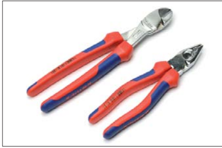
Side-cutting plier / Combination plier