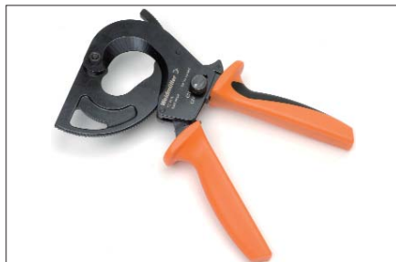
Large cable cutter