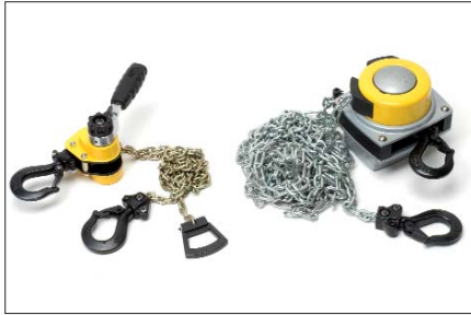
Chain hoist / Chain block