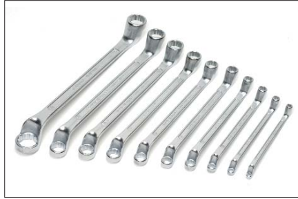
Double-end ring spanner set