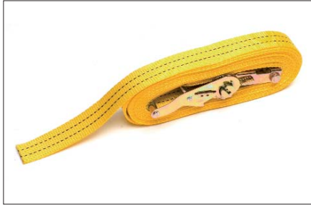
Ratchet lashing strap