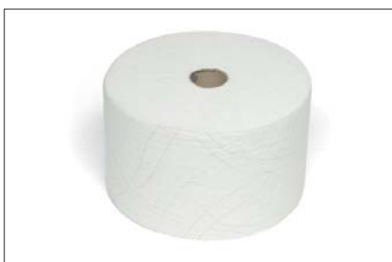
Paper cleaning tissue